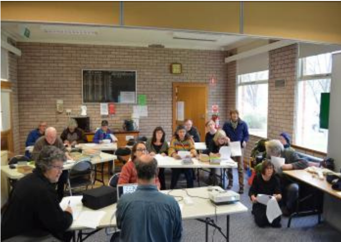
CTQ Winner 9/13